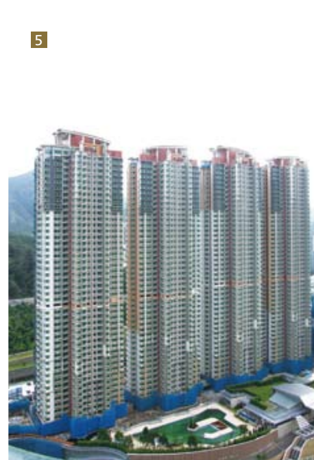
1 The Westminster Terrace, Yau Kom Tau 油柑頭皇璧